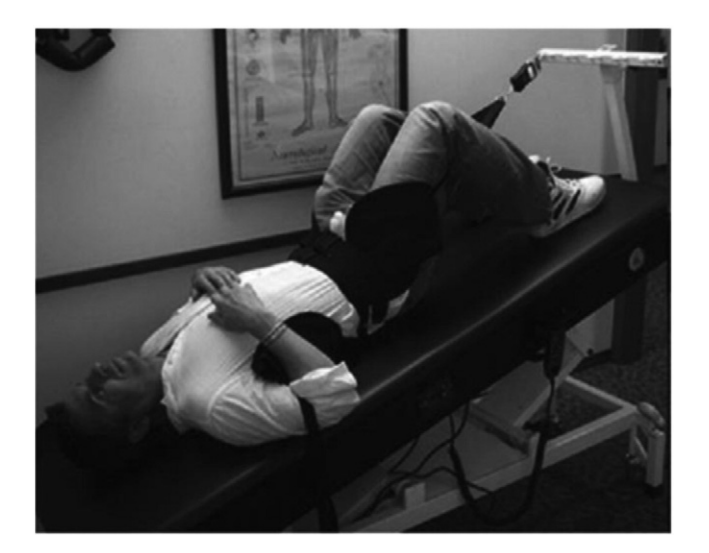
Fig 2. Photograph of vibration inversion therapy. The patient was inverted approximately 20° and vibrated at approximately 25 Hz. This procedure was performed at every office visit for the entire 8-week trial.

Subsequent to the stretches, low-velocity/moderateamplitude articular manipulation was delivered to the dysfunctional spinopelvic segments. In this case, MUA techniques were performed on the thoracic spine, lumbar spine, pelvis, and hip joints bilaterally. These techniques are thoroughly illustrated by Gordon.<sup>20</sup> All of the procedures were performed by both of the authors in tandem. Because the patient was nonresponsive, one physician performed the techniques, whereas the other stabilized the patient. Following the conclu-