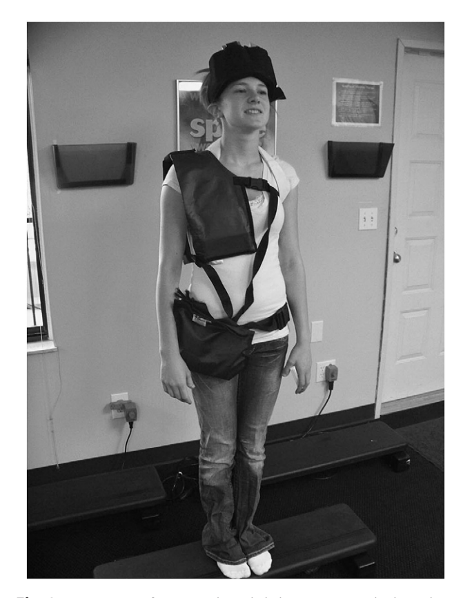
Fig 3. Image of external weighting system designed to facilitate correction of the thoracolumbar curvature while at home. She was instructed to wear these weights at home daily for 15 minutes beginning in week 3 of her care. These weights were specifically configured for her based upon her existing spinal structure, and she was radiographed while wearing the weights to ensure correct placement.

sion of the MUA, the patient was taken by hospital bed to recovery and was discharged without any intra- or postoperative complications. The patient was instructed to relax for the rest of the day and report back for days 2 and 3 of the serial MUA. Before days 2 and 3 of the MUA, the patient was assessed to document any subjective and objective improvements following the first MUA procedure. Subsequent MUAs are not administered if functional or subjective improvements are not observed, or if the patient improves 80% or more after the first MUA. However, a second and third MUA is scheduled if the patient makes an approximately 50% to 70% improvement following the prior MUA.<sup>20</sup> Each of the procedures discussed above was repeated on both days 2 and 3. When the patient was discharged on the third day, the author (MNS) prescribed 600 mg ibuprofen every 6 hours to mitigate the inflammatory response, thus inhibiting the reformation of fibroadhesions around the affected joint structures.